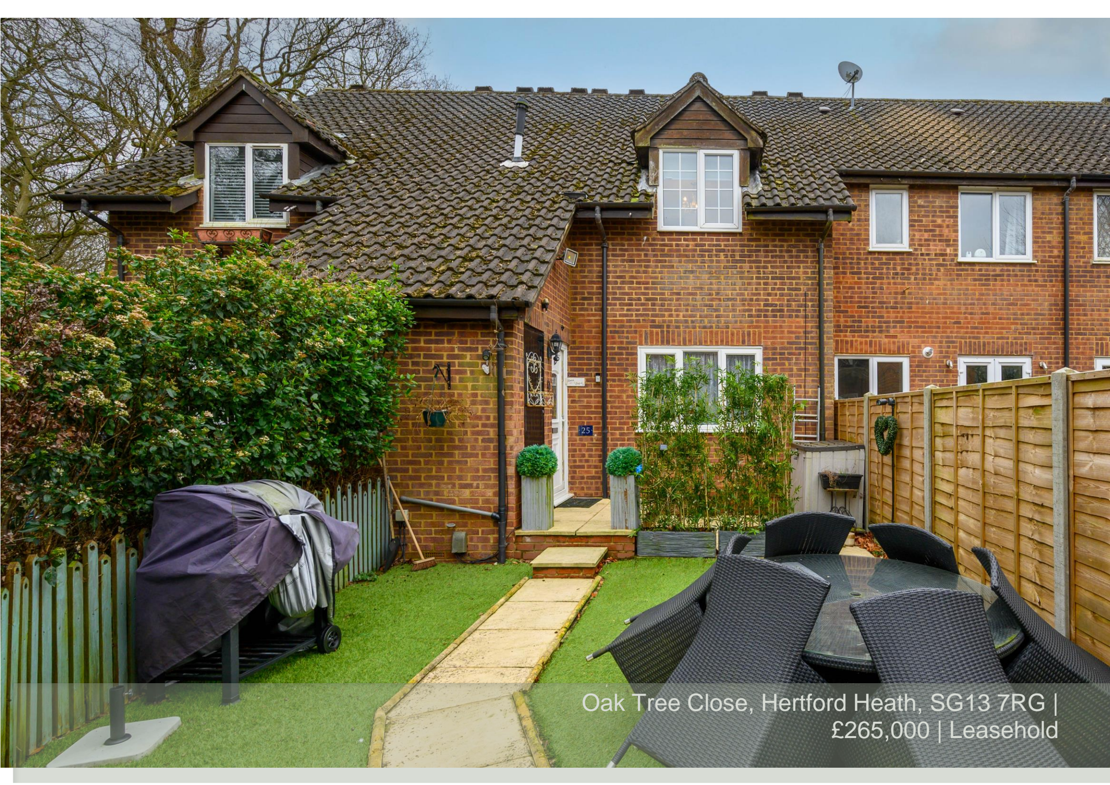
Oak Tree Close, Hertford Heath, SG13 7RG | £265,000 | Leasehold